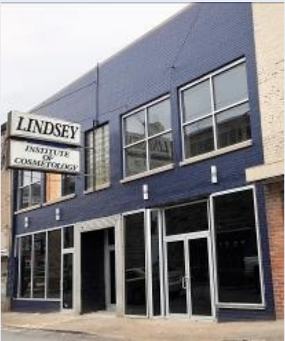
This building in downtown Campbellsville will soon be home to new living spaces on the second floor and a law office on the main floor.