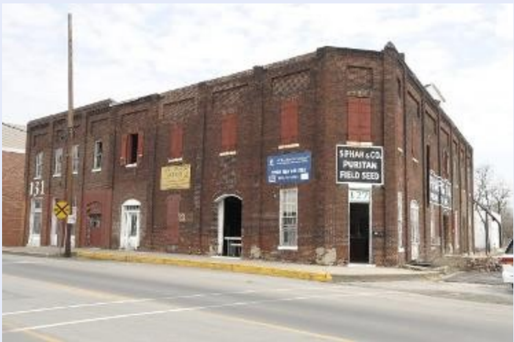
Keeping our fingers crossed for this grand old building in downtown Winchester!!